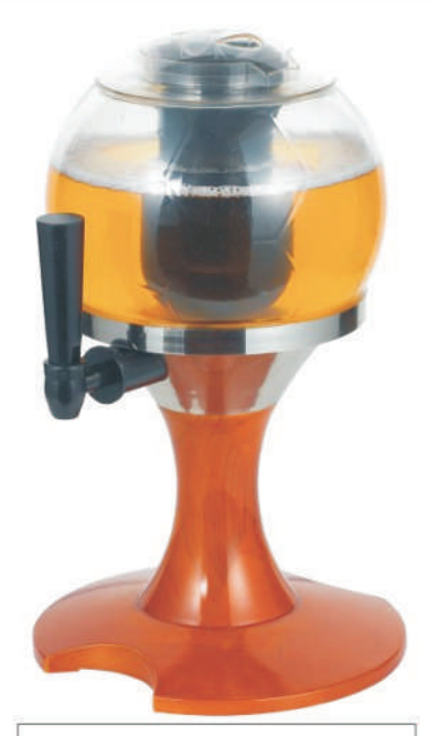
BB-FD00W-RT Real wood