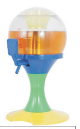
BB-FD001 Any color2