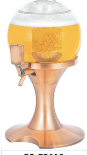
BB-FD00C Copper plated