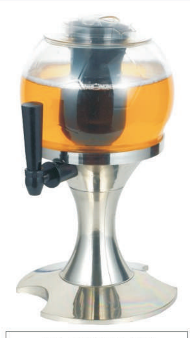
BB-FD002-RT Nickel plated

The default tap is the reference TAP-005-A with black body but all our other references of tap can fit with the Beer Balloon Professional.