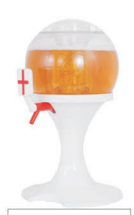
BB-FD001 Any color3